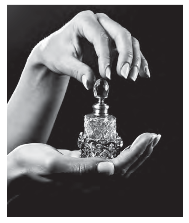
March—May 2025